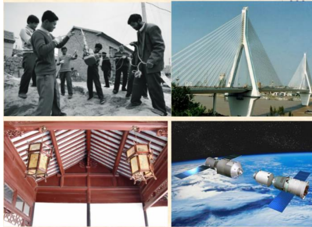
Figure 1. Life-oriented teaching resources of system of forces