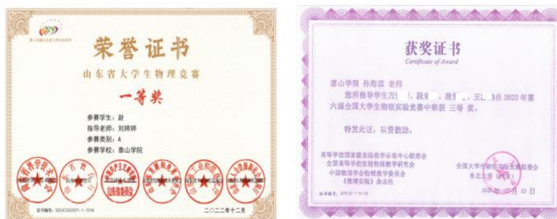
Figure 3. Undergraduates' certificates of award

We guided undergraduates to participate in the Shandong Undergraduate Physics Tournament, the Shandong Undergraduate Physics Experiment Tournament, and the Shandong Innovation Tournament of Undergraduate physics, and achieved excellent results. In the preparation stage of the competition, undergraduates' independent creation is the main way, supplemented by teachers' guidance, which is related to the problem. The principle and experimental scheme are independently inquired and designed by students. Students carry out practical research according to the physics principles they have learned, design experiments by themselves, verify physical phenomena and laws, consolidate the physics knowledge they have learned, stimulate undergraduates' interest in physics learning, cultivate undergraduates' team cooperation and cooperation spirit, and exercise their practical ability and scientific and technological innovation ability. Figure 3 is the certificates of award of undergraduates.